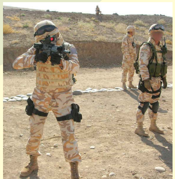
Showing the shooting practice of Korean Special Force wearing our products.