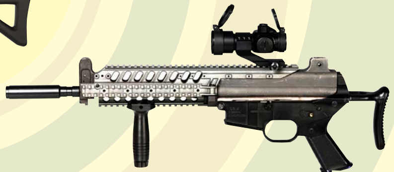
〈 Korea Small arms K1, Model DT323 〉